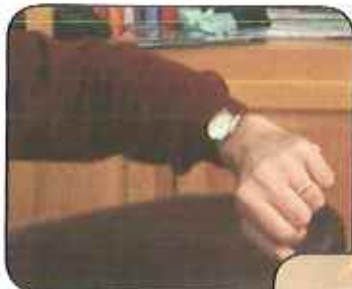
Do not chew for 30 minutes

It is not a problem for a small portion of a temporary filling to wear away or break off, but if the entire filling wears out, or if a temporary crown comes off, call us so that it can be replaced.