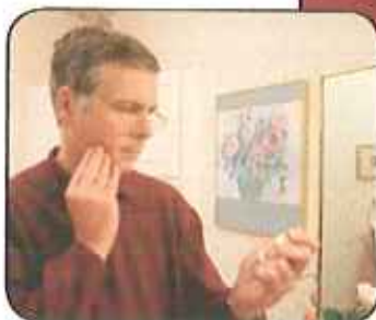
Take pain medication for discomfort