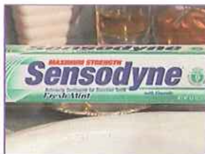
Use desensitizing toothpaste