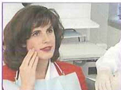
Avoid chewing until numbness wears off